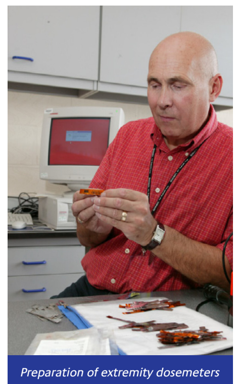
Preparation of extremity dosimeters

The EPD Service now has 19 nuclear site licence holders as clients. Data is processed and assessed for approximately 100,000 entries into controlled areas per month.